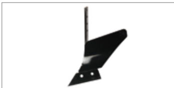
Plough Code 69209082 (requires tool holder 69209087 )