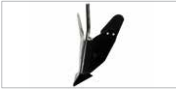
Furrowing tool Code 69209081 (requires tool holder 69209087 )