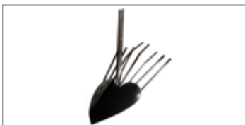
Potato digger Code 69209083 (requires tool holder 69209087 )